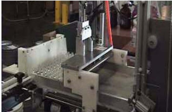
Automatic Bottle Feeder

Art of Beauty ( www.artofbeauty.com ) is a world leading manufacturer of natural, professional nail care products and cosmetics. Brands include ZOYA featuring Toluene, Formaldehyde and Dibutyl Phthalate Free ZOYA Nail Lacquers, REMOVE+ (polish remover, nail cleaner, nail prep) and HOT LIPS Glossy Lip Balms and QTICA body, hand and nail care.