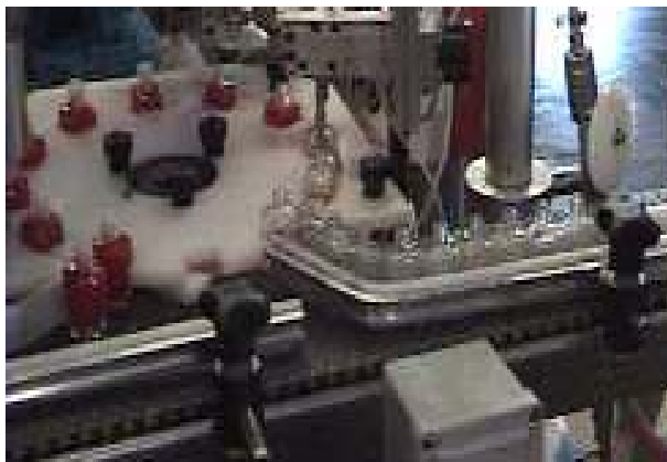
Automatic Filling Monoblock