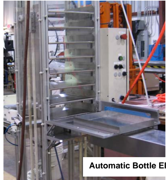
Automatic Bottle Elevator